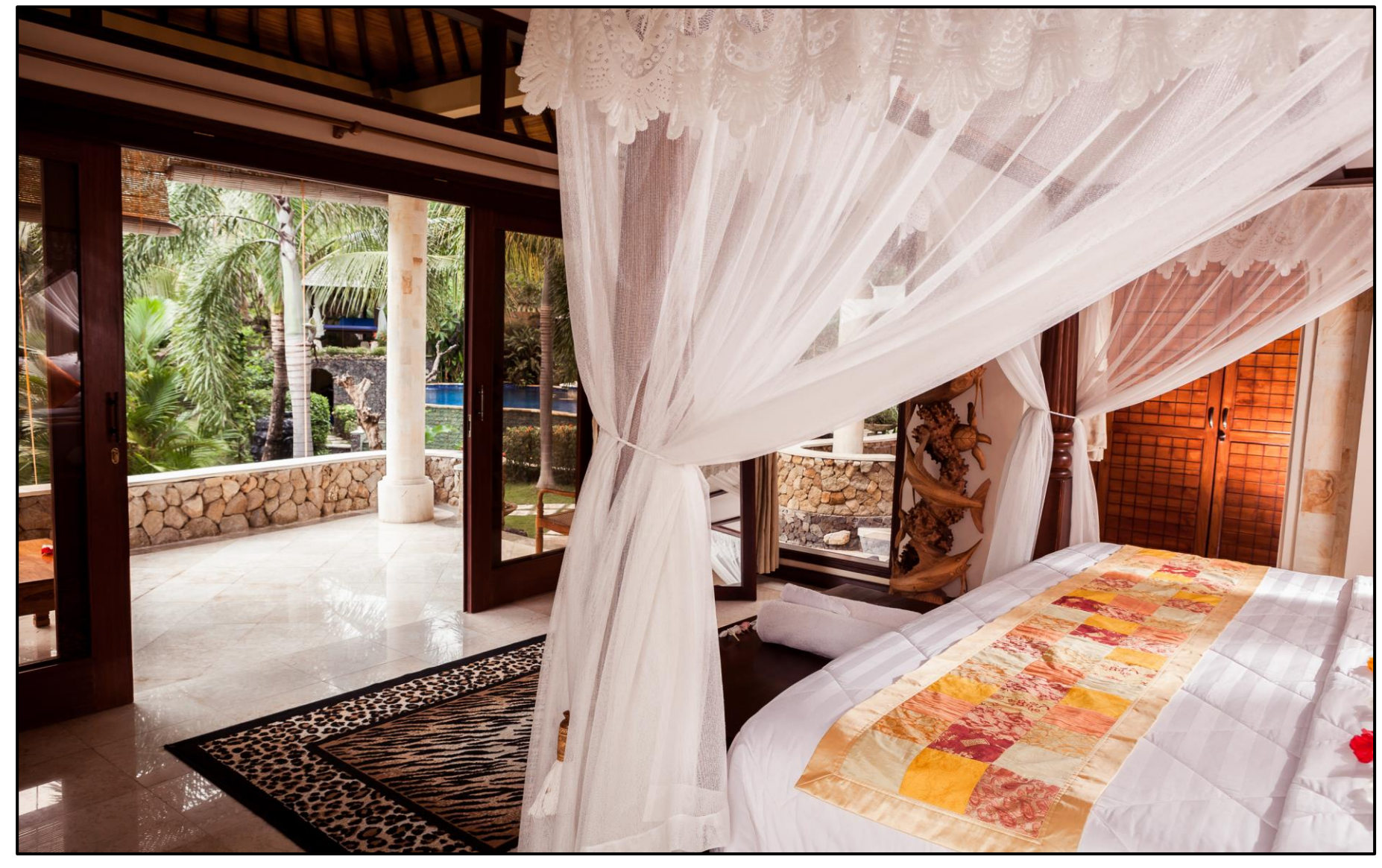
The property features a private pool, full kitchen, WiFi and satellite TV.