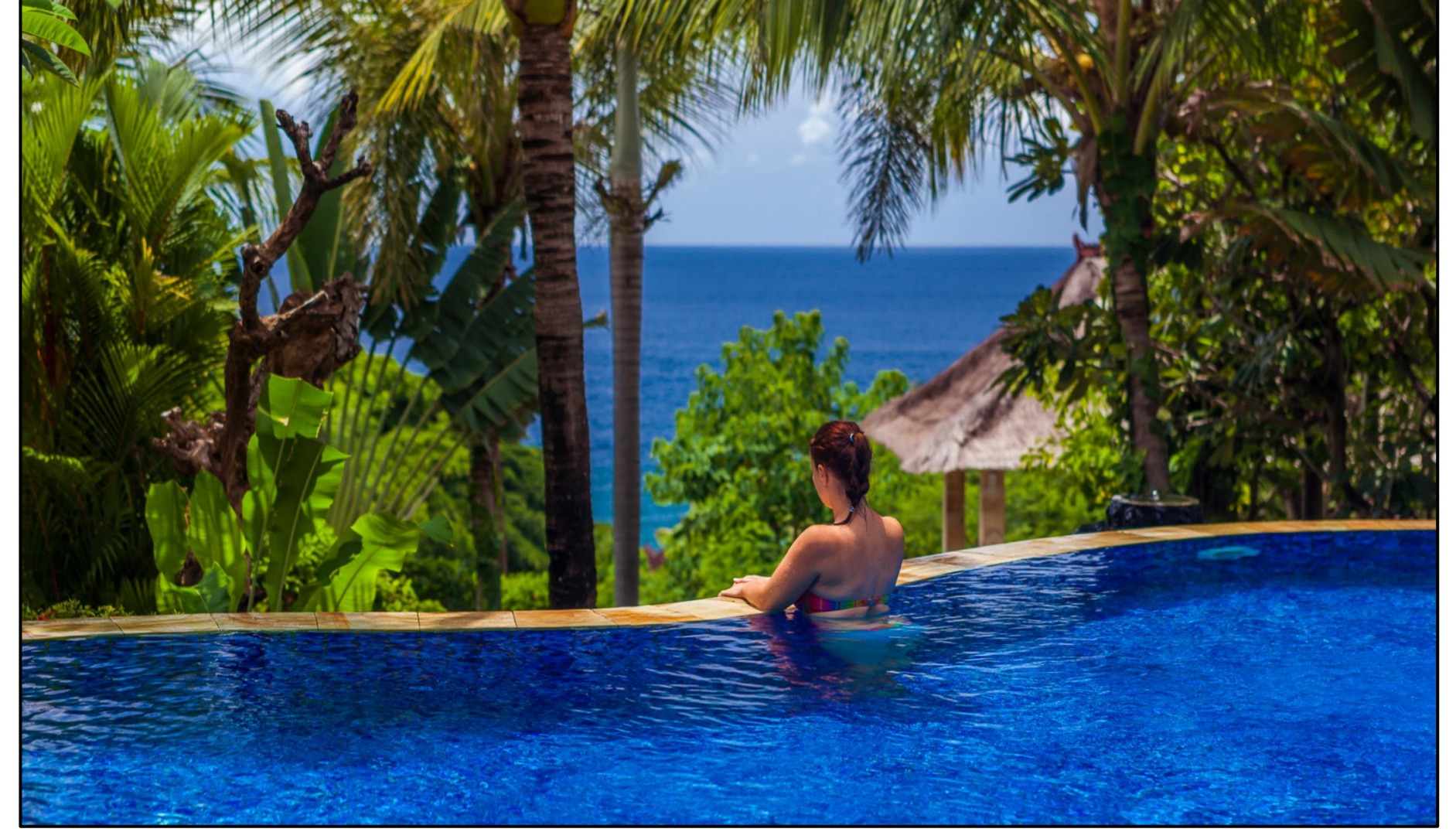
Only a two minute walk to the beach!!