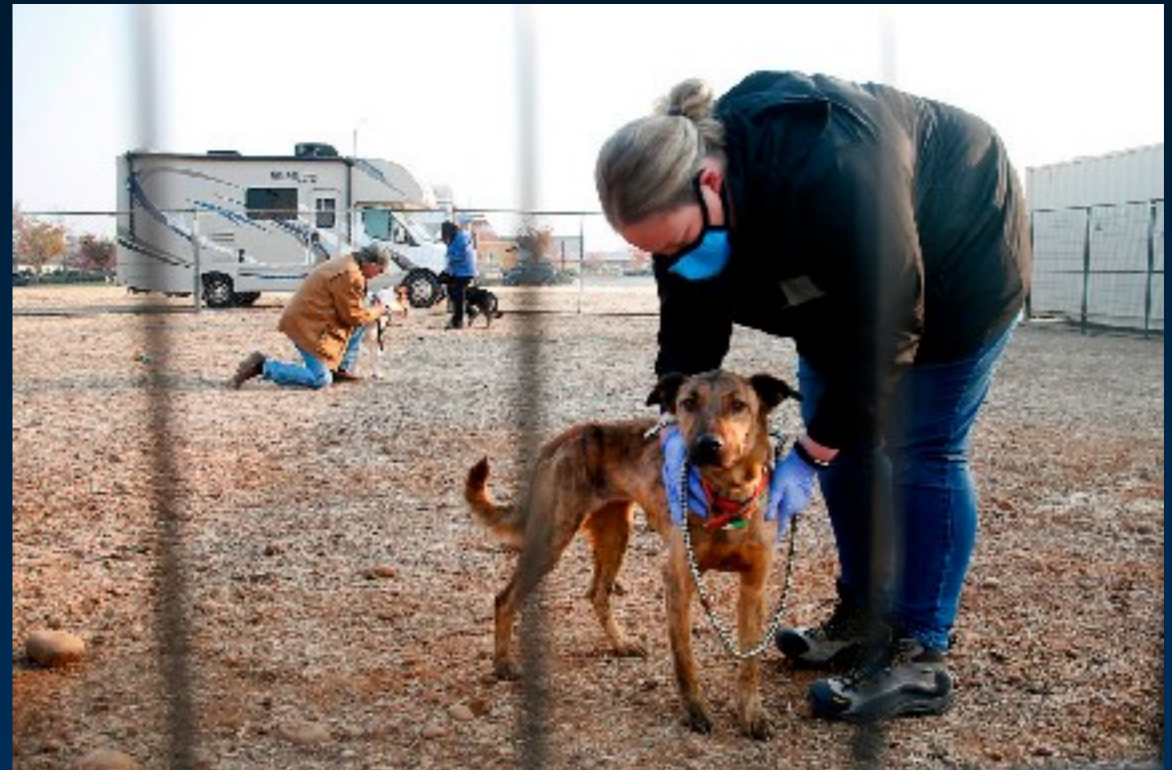
Chico Enterprise Record